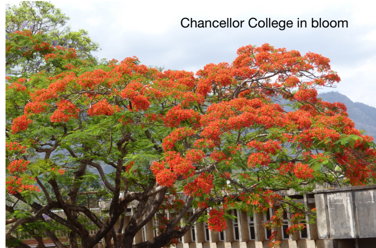
Chancellor College in bloom

being re-considered and needs further discussion with Chanco. It is now thought it might be more appropriate to identify someone in Malawi but provide them with support from SSWIM.