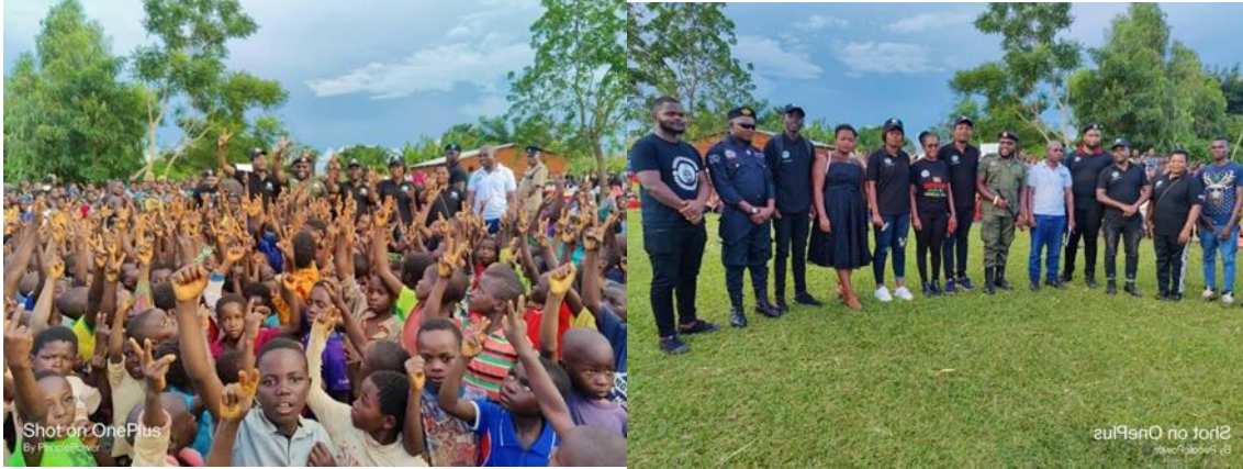
Child Safety Event at the Children's Corner in Dedza March 2022.

are facing which are on the rise in the District. With the insufficient social workers in the District, the trained Children's Corner Facilitators will assist in provide quality social services to improve outcomes for children and their families.